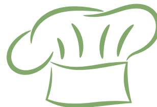
Chef Crafted Soups