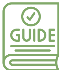
Supports Dietary Needs