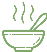
4.5 Million Hugs in a Bowl